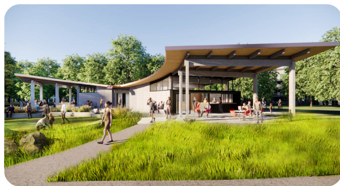
The new amenities building in Centennial Park will feature restrooms, a picnic area and a food concession.