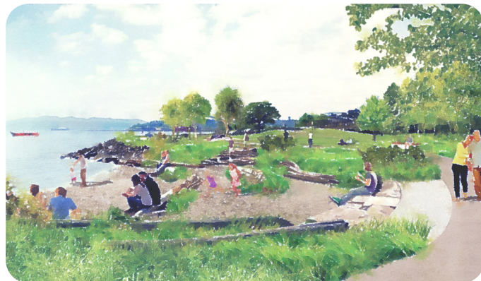
EBC will restore the beach coves in Myrtle Edwards Park, making it easier for people to touch the water.