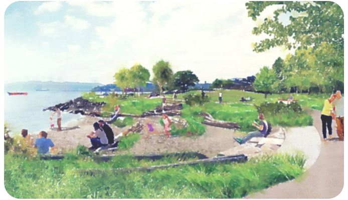
EBC will restore the beach coves in Myrtle Edwards Park, making it easier for people to touch the water.