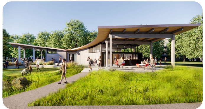
The design of the new amenities building in Centennial Park and its surrounding landscape draws on Coast Salish culture.