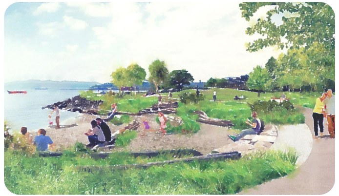
EBC will restore the beach covers in Myrtle Edwards Park, making it easier for people to touch the water.